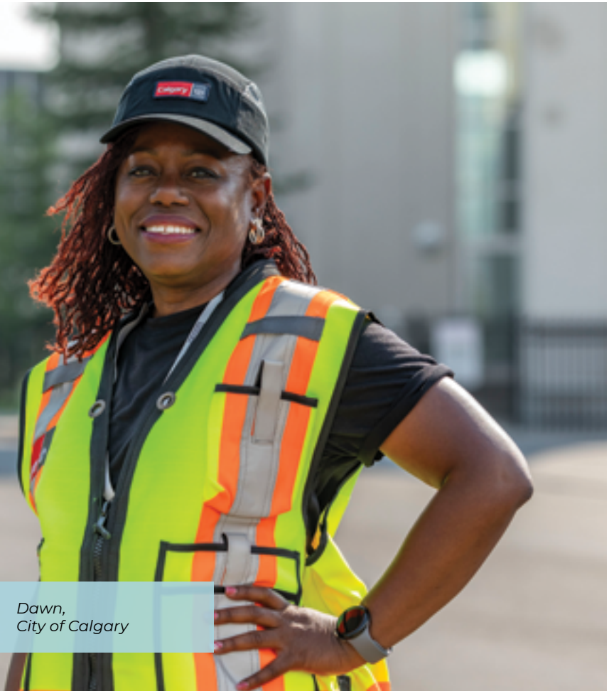
Dawn, City of Calgary

If you don't return to work at the end of your leave, or if you change to a non-participating position, you need to apply to purchase the leave period within 30 days of the day you stop participating in LAPP.