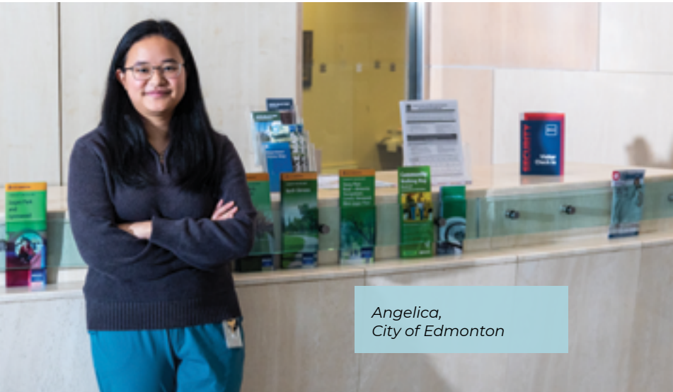
Angelica, City of Edmonton

Use the Pension Projection Tool to estimate your future pension benefit by logging into Your Pension Profile at lapp.ca .